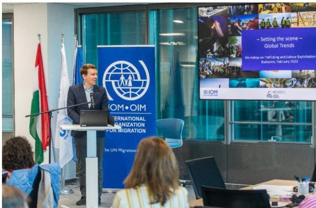
IOM Hungary Head of Office gives a speech to open the workshop.

Crisis-affected people coming from Ukraine might be exposed to labour exploitation or related trafficking due to their vulnerable situations. IOM Hungary has extensive knowledge of this risk, thanks to the expertise matured by Counter-Trafficking Team over the previous years. In this regard, last week IOM co-led a workshop, together with UNHCR and Menedék Association, on the available tools to better identify and protect at-risk refugees from Ukraine in Hungary.