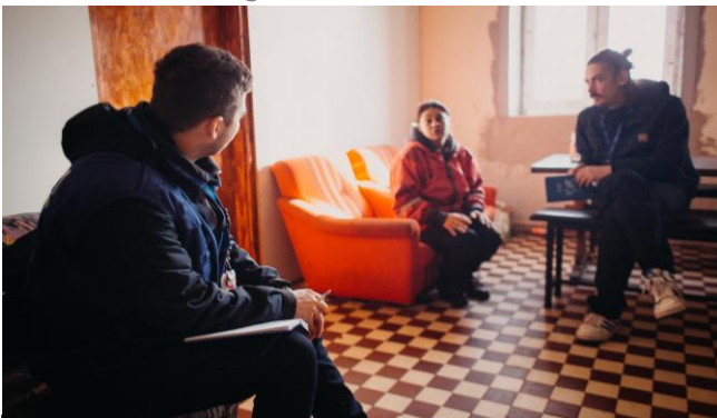
IOM staff members assessing the needs of a family accommodated in a farm in the bordering region.

Since the beginning of the crisis, IOM Hungary's mobile team has provided much needed information, as well as mental health and psychosocial support, cultural mediation and interpretation services in the region bordering Ukraine. During their periodic visits to the shelters where refugees from Ukraine are accommodated, IOM staff members conduct regular assessments to identify needs and provide adequate support. Recently, the lack of employment opportunities and the difficulty to access education facilities due to the large geographical distances have been identified as some of the main hardships experienced by families in the region.