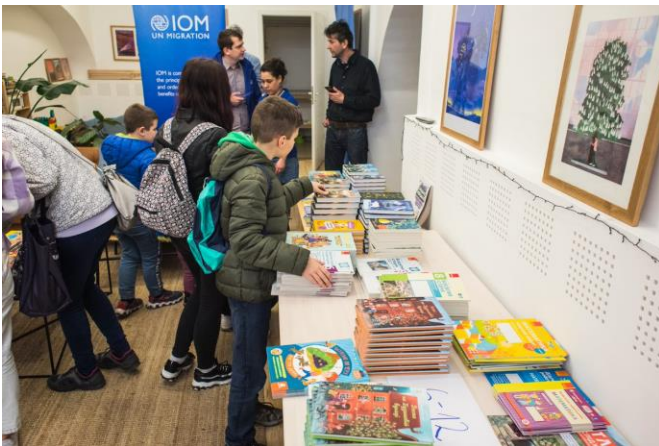
Book fair in Budapest Helps! Info and Community Center.

IOM Hungary extensively acknowledges the importance of spurring education involving children displaced by the war in Ukraine. Among the various activities supported in this regard, IOM successfully organized a book fair in Budapest Helps! Info and Community Center last week. The event led to the delivery of hundreds of Ukrainian scholastic books to several children accompanied by their families.