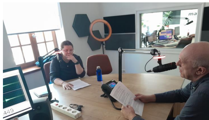
Interview with the Manager of the Ukrainian Emergency Response of IOM Hungary at Help U Radio.

Help U is a Ukrainian-speaking online radio operating since June 2022 with the purpose of sharing practical advices for people on the move and new arrivals, including information on settlement and safe employment. The radio's program aims to help and encourage refugees to cope with the new environment, as well as to reinforce local awareness. This month, Help U radio and IOM Hungary have started a cooperation, which contributes to the dissemination of information related to IOM activities, by advertising the IOM Hotline and interviewing IOM staff. Moreover, the radio is now available at Nyugati Info Point and Budapest Helps! Info & Community Center.