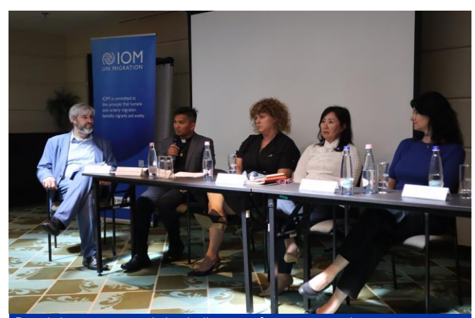
Panel discussion on daily challenges of migrant workers

Migrant workers in Hungary face labour exploitation risks, prompting IOM Hungary to organize a roundtable discussion in June 2023, supported by the Republic of Korea. Key issues discussed include language barriers, hazardous jobs, exploitation, higher scrutiny, and cultural conflicts. Ukrainian refugees, often overqualified for their jobs, experience skill mismatches. Integration challenges persist, necessitating support measures such as childcare and qualification recognition. Information gaps are common. Recommendations include depoliticizing the issue, simplifying regulations, and enhancing governmental capacity. IOM Hungary focuses on protecting migrant workers, promoting legal migration, and fostering integration. For more information click here .