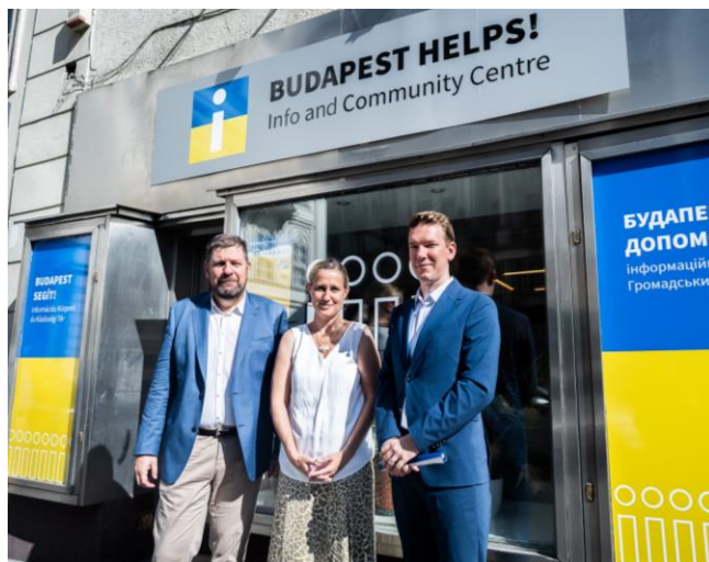
The representatives of the Municipality of Budapest, UNHCR and IOM Hungary, celebrating the 1-year anniversary of the Budapest Helps! Info and Community Centre

The Centre offers a wide array of services, including guidance and support for accessing social services such as education, healthcare, financial aid, accommodation, and mental health services. It also serves as a reliable source of information, addressing questions about life in Hungary for displaced people from Ukraine.