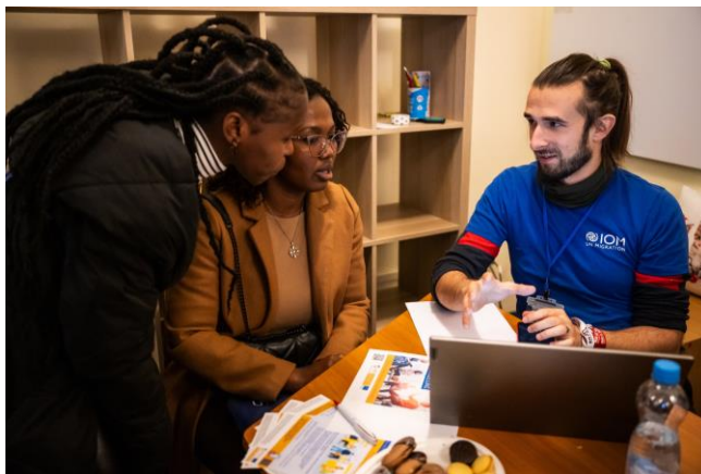
Individual consultation at the IOM Hungary CV Corner

On 25 November, IOM Hungary and UNHCR teamed up for Budapest's unique Job Fair, designed specifically for refugees from Ukraine and third-country nationals living legally in Hungary. The goal was to give an opportunity to job seekers on the Hungarian job market, especially those displaced from Ukraine. The Job Fair connected job seekers with employers and agencies, offering practical advice on CVs and job applications from IOM's experts. Workshops covered career development and safe employment, shedding light on labour rights in Hungary. This initiative aimed to link talent with opportunities, demonstrating an effort to assist displaced people in securing employment.