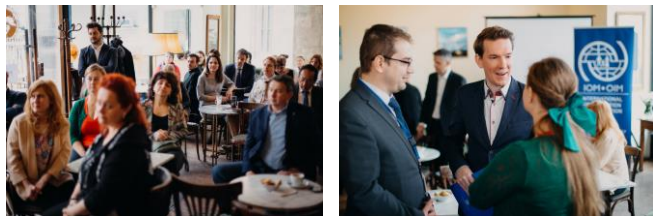
IOM stakeholders and staff-members coming together at the year-end event.

As this year nears its conclusion, IOM Hungary had the pleasure of hosting a number of stakeholders who have been involved in the response to the Ukrainian emergency during the past nine months. Among them, some of IOM Hungary's donors and implementing partners participated. IOM Hungary has been supported by nine donors in the expansion of the mission and the activities developed as a response to the emergency. At the same time, IOM has benefited from cooperation with nine different actors who have contributed to support areas such as the provision of basic needs, food and non-food items, accommodation, refurbishment, and education. Overall, yesterday's event was an excellent opportunity to reflect on the year's achievements.