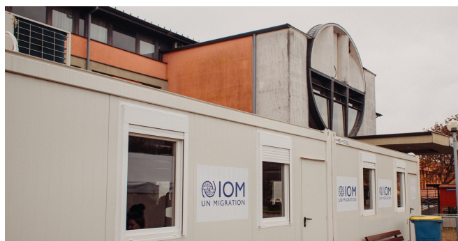
Záhony Helps Container operative since October 2022 at the train station.

In October 2022, the new Záhony Helps Container was settled close to the train station where hundreds of people coming from Chop (Ukraine) transit every day in Záhony. This box was provided to the Municipality by IOM as part of the winterization plan. Besides being an important gathering point for all the actors involved in the protection response every day in the area, it contains a cafe and a child-friendly space usable by crisis-affected people. Although nine months have passed since the beginning of the emergency crisis, Záhony continues to be the main focal operational point at the Hungarian border.