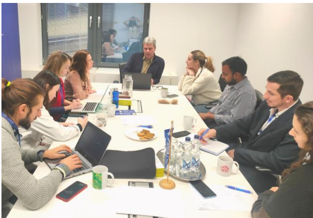
DTM Enumerators attending an information provision training at the IOM offices in Budapest, Hungary.

The Displacement Tracking Matrix (DTM) of IOM Hungary has been active since August 2022. Over the last six months, staff conducted thousands of interviews to track the displacement patterns, needs and intentions of crisis-affected people both in Budapest and in the border region. According to the report of December 2022, most of the respondents were women between 18-29 years old, and travelling in group with the intention to stay in Hungary. Among the needs assessed during the surveys, the provision of information regarding Accommodation stands out. Therefore, IOM Hungary continues to train its DTM Enumerators in order to improve its information provision assistance.