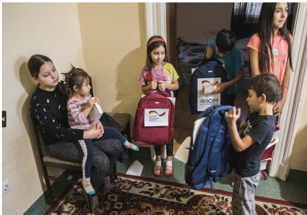
Last week, a group of children hosted by IOM was provided with schooling items.

IOM Hungary continues to conduct needs-assessment of crisis-affected people provided with accommodations. Therefore, case workers are constantly in contact with these beneficiaries in order to address their requests. One of them is the availability of non-food items, that can range from hygiene kits to stationery. Thanks to the support of Germany, last week IOM delivered schooling items and bags to a group of children hosted in one of the mid-term accommodations.