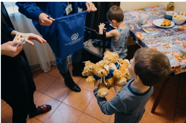
IOM case workers during the weekly visit to one of the accommodations run by IOM Hungary.

One of the pilot activities run by IOM Hungary is the provision of housing to crisis-affected people. The service aims to embrace a broader scope of assistance than the mere offer of shelter. Hence, IOM case workers regularly visit the beneficiaries in order to distribute food vouchers, assess their needs and refer them to other IOM operational support, partners or external aid. During the latest weekly visit, IOM's staff surprised the hosted children with teddy bears.