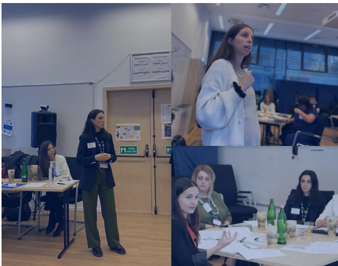
IOM protection and CT specialists during the first workshop session about CT within the Ukrainian crisis response.

IOM Hungary has been working to advocate for counter-trafficking measures as part of the Ukraine crisis response. IOM protection and counter-trafficking (CT) specialists are organising a series of counter-trafficking workshops in partnership with UNHCR and stakeholders. The first workshop session was successful, and included discussions around best practices for identification and referrals of children at risk within the Ukrainian crisis response.