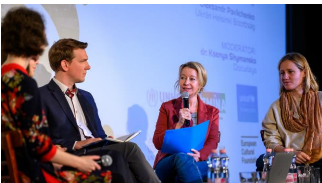
Crisis Without Borders panel discussion organized by Verzio, with the participation of the Head of IOM Hungary.

Since November 8, the Verzio Human Rights Documentary Film Festival, "Burning Issues", is being held in Budapest. The key topic of this 19th edition is the war in Ukraine, alongside other looming issues such as migration, the energy crisis and the consequences of climate change. As part of the festival, last week Verzio invited a range of actors, including IOM Hungary, to participate in a panel discussion on the importance of cooperation between international organizations and NGOs in times of crisis, especially in the Ukrainian one. Also, in December IOM will show one of the movies screened during the Verzio Film Festival at the 2022 Global Migration Film Festival.