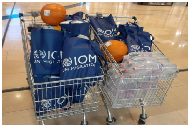
IOM Hungary provided food and NFIs for the Ukrainian community event commemorating Defender's Day.

Over the weekend, IOM Hungary helped the Ukrainian Greek Catholic Church Foundation in Hungary with their community event to commemorate Defender's Day. IOM provided food and non-food items (NFIs), including stationery for children's activities. Approximately 200 people attended the event offering diverse cultural, creative and arts activities, and enjoyed the community experience and communal lunch.