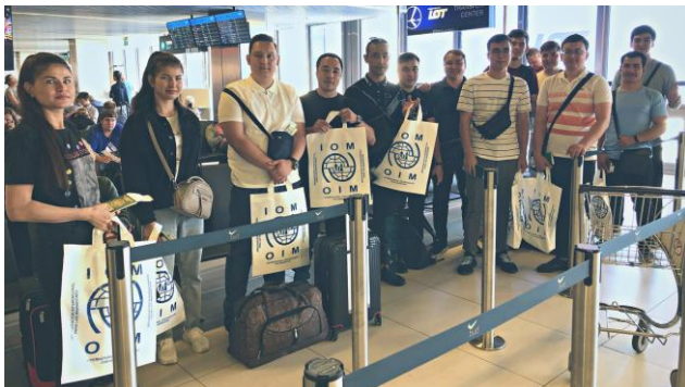
Beneficiaries of VHR assistance at Budapest Airport about to return to their country of origin.

Last month, IOM Hungary assisted 14 third-country nationals from Turkmenistan who reached Hungary after the breakout of the Ukrainian crisis. The beneficiaries were studying at a Ukrainian university and, after having received shelter assistance from IOM Hungary, decided to apply for the Voluntary Humanitarian Return (VHR) programme in order to return to Turkmenistan. IOM also assisted with the provision of food, hygiene-kits and COVID-19 testing.