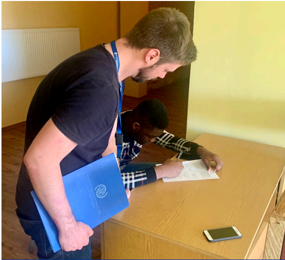
IOM case worker assisting a beneficiary at the Red Star Hotel.

To this moment, it is estimated that over 6,983,041 1 persons have been forcibly displaced into neighboring countries, with still more projected to move out of the country.