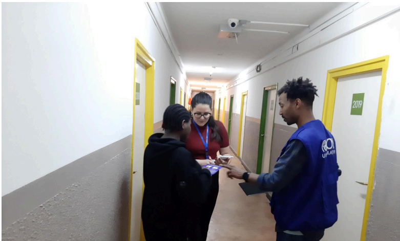
IOM is counselling third country nationals on the option to apply for Voluntary Humanitarian Return to their country of origin.

To this moment, it is estimated that over 6,029,705 1 persons have been forcibly displaced into neighboring countries, with still more projected to move out of the country.