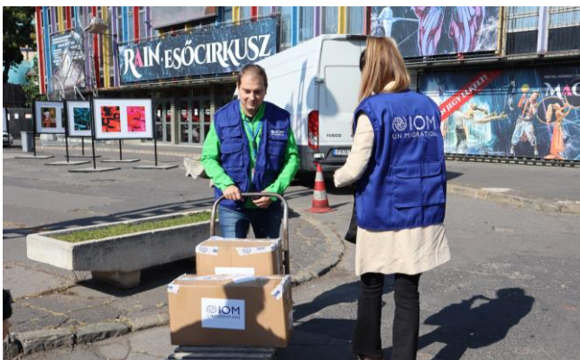
Delivery to beneficiaries at the Capital Circus of Budapest by IOM workers.

The Capital Circus of Budapest is hosting and supporting 65 student performers. IOM Hungary delivered school supplies, including stationery and tablets, to the Ukrainian students, families, and instructors hosted by the circus. The tablets will play a vital role in their continued studies by giving students access to translation software for their online lessons.