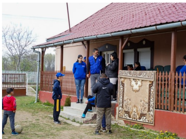
IOM MOBILE TEAM VISITING PEOPLE ACCOMMODATED IN VILLAGES AT THE BORDER AREA