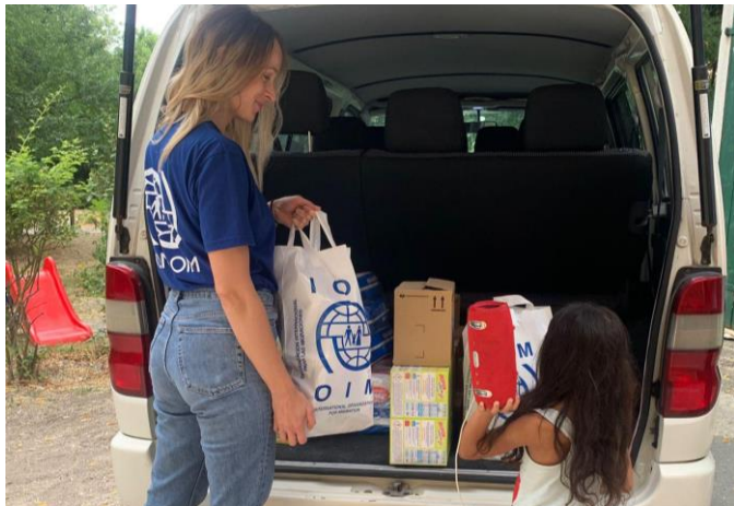
IOM case worker distributing NFIs to an accommodation site operated in Budapest.

To this moment, it is estimated that over 10,623,910 1 persons have been forcibly displaced into neighboring countries, with still more projected to move out of the country.