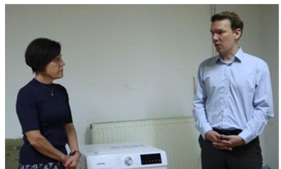
IOM Hungary's Head of Office hands over household appliances in a shelter operated by the 22 nd District's Municipality.

IOM Hungary is successfully pursuing the cooperation with the Municipality of Budapest Capital City and the districts providing accommodation to refugees. IOM case workers regularly visit accommodation centers managed by the local municipalities and partner NGOs to assess the needs and to provide assistance in various means. This week IOM delivered hygiene items and provided household appliances to beneficiaries accommodated by the municipalities.